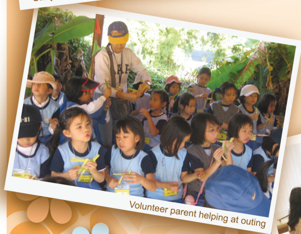
Volunteer parent helping at outing