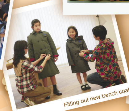
Fitting out new trench coat