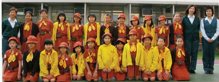
Brownies and Parent Guiders