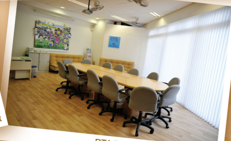
PTA Room in the new campus