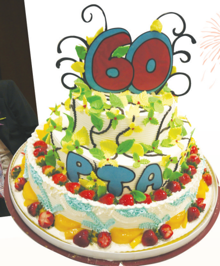
PTA 60th Anniversary Cake