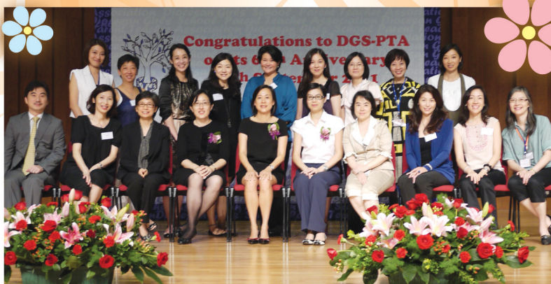
PTA Executive Committee 2011-2012

As most of you who attended our 60th Annual General Meeting on 30th September 2011 would know, our PTA is now 60 years old! We are the oldest parent-teacher association in Hong Kong and we are involved in many important activities in the school. Our purpose is to foster communication and build a sense of community among parents, students and the school. We support the school when needed, and organize activities throughout the year for the benefit of our school and students.