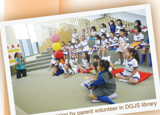
Storytelling session by parent volunteer in DGJS library

Our PTA is here to serve you! If you have any questions or suggestions, please feel free to contact our Executive Committee members in charge of specific events and activities.