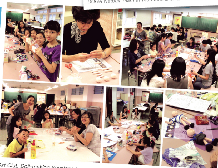
Art Club Doll-making Sessions in summer 2010

Due to overwhelming demand after the DGS 150th Anniversary Dinner, the Art Club hosted two doll-making sessions during the summer for members to make their own DGS dolls. Almost 100 participants attended, including old girls and their young ones, kneading the dough, rolling the pins, dotting the eyes and crossing the belts. Everyone brought home a lovely pair of DGS dolls.