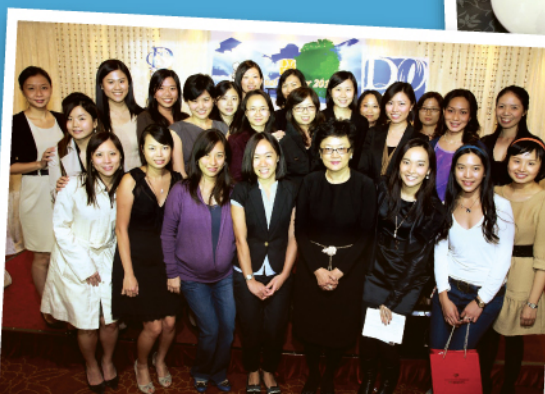
Best turnout class – Class of 1995 with 30 old girls