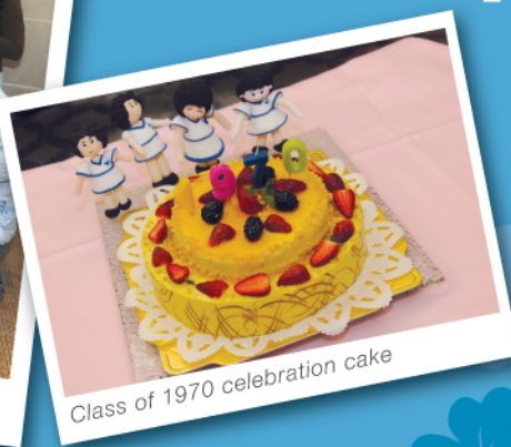
Class of 1970 celebration cake