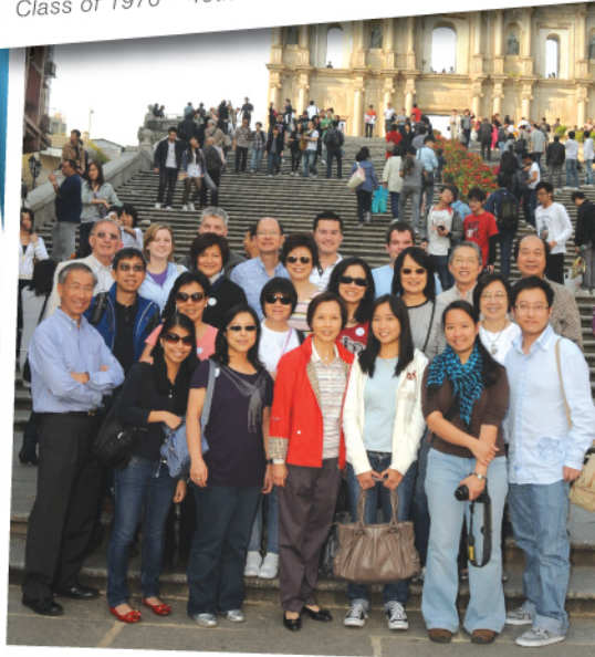
▲ Macau trip