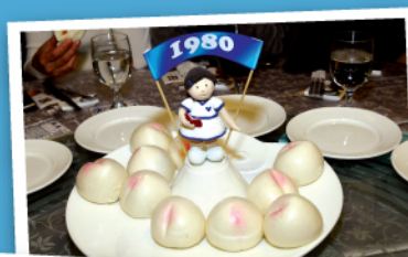
Celebration buns decorated with DGS doll

The 2010 DOGA Annual Dinner took place on 29 th October at the newly renovated King's Cuisine restaurant in Causeway Bay. The evening kicked off with a wine and cheese cocktail on the patio. In line with this year's annual dinner theme, Qi Dai, for anticipation and expectation, the event featured highlights from the DGS 150th Anniversary Dinner and showcased images of the DGS campus which is under redevelopment. The evening was a great success with a full house of 441 girls attending spanning from class of 1934 to 2008. The Heritage and Homage Timber Sets and the DGS gold/silver plated charms were popular items at our souvenir sales counter. Best turnout class was awarded to Class of 1995 who celebrated their 15th reunion with 30 classmates.