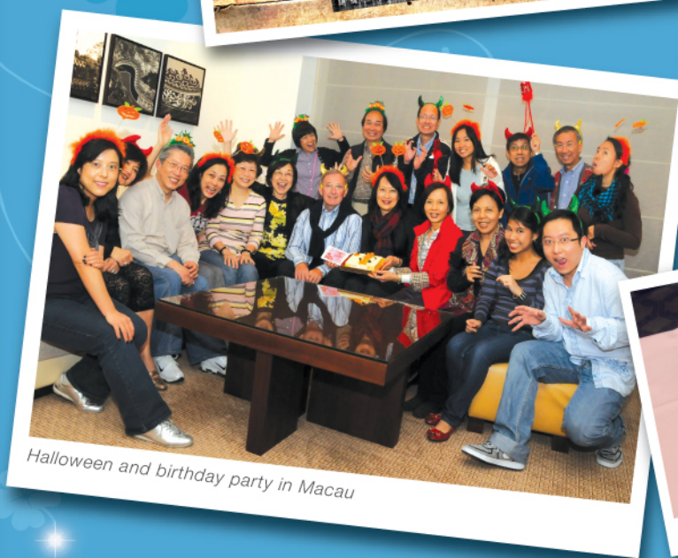
Halloween and birthday party in Macau