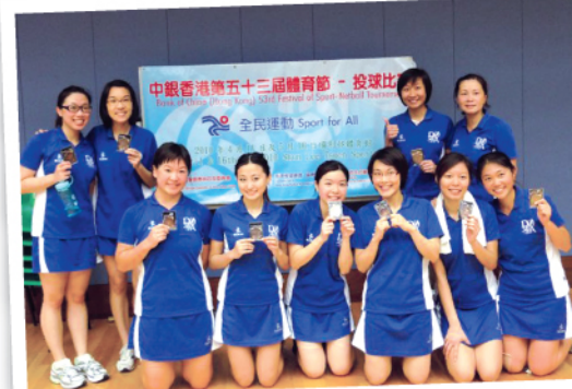
DOGA Netball Team at the Festival of Sports 2010