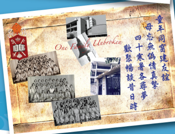
Photo frame with class photo and poem dedicated to the Class of 1970