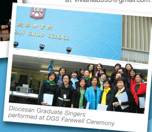
Diocesan Graduate Singers performed at DGS Farewell Ceremony