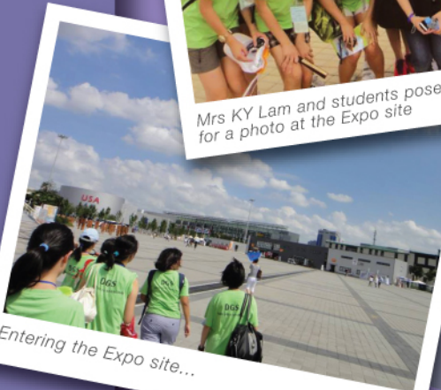
Entering the Expo site...