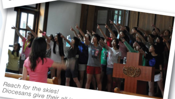
Reach for the skies! Diocesans give their all in rehearsal