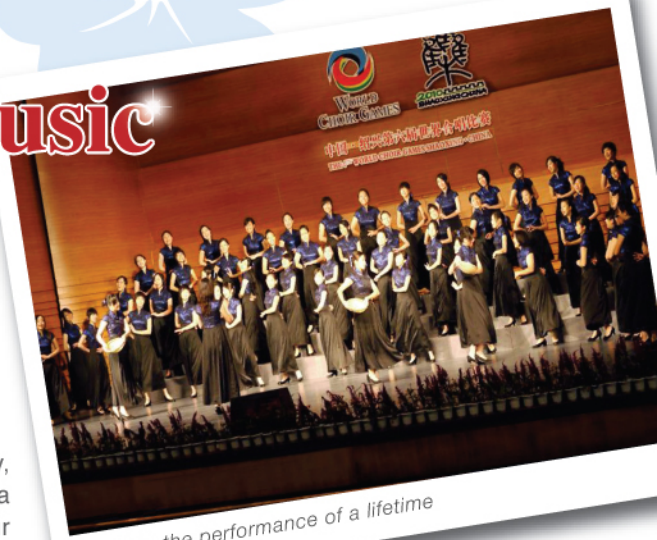
Cai Cha: the performance of a lifetime

An arrangement of the traditional Chinese folk song about young girls picking tea leaves. Four of our dancers flit across the stage, the rest of us giving our best impressions of delicate leaf-picking hand movements. The repeated consonance and sibilance in the lyrics even sound like the soft rustling of leaves. We sing this especially proudly, because it showcases the vibrancy of Chinese culture. Our experience on this trip also brought Chinese culture to us. With our visits to Qing Ming He Fang Street Night Market and a World Cultural Heritage site, we greatly enjoyed learning more about local culture.