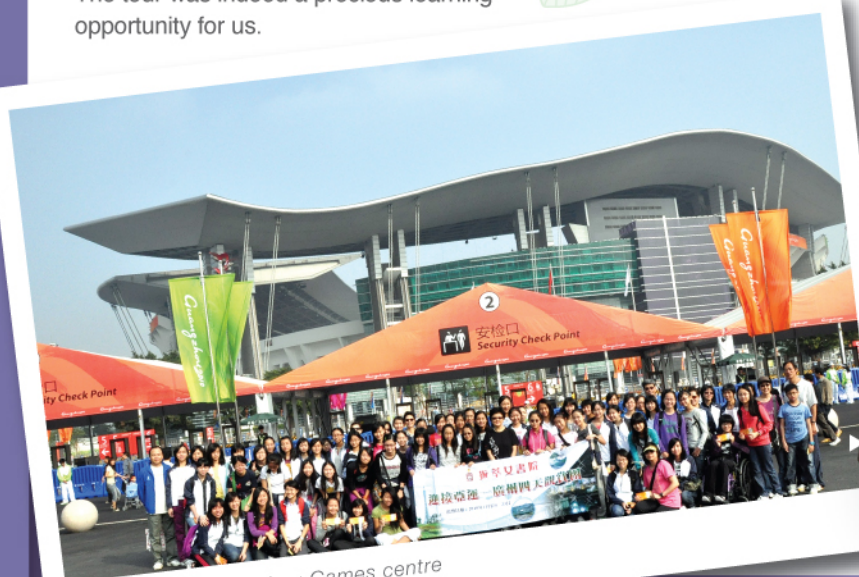
Arrival at the Guangzhou Games centre