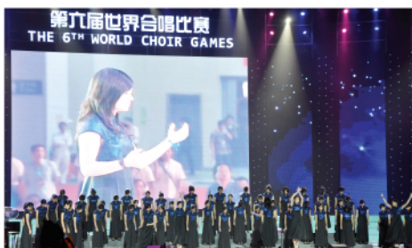
Invocation- an unforgettable experience