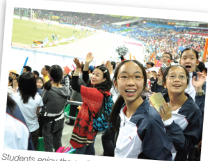
Students enjoy the excitement of the games

The tour was indeed a precious learning opportunity for us.