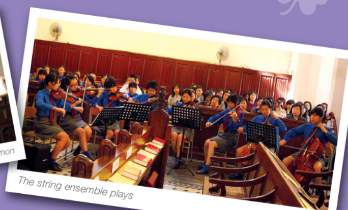
The string ensemble plays