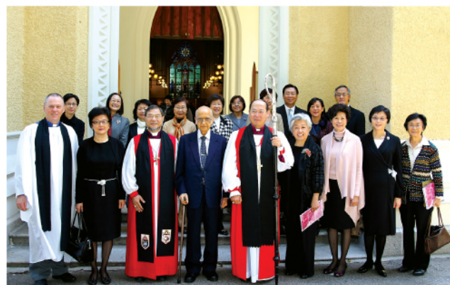
After the service

The Bible readings given by the Supervisor, and the present and former Headmistresses of both Senior and Junior schools firmly echoed the school vision and the values inculcated, which serve as the base of all knowledge and skills.