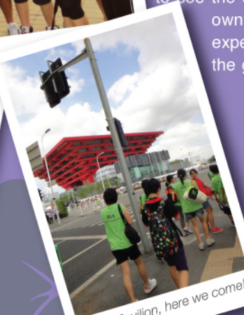
China Pavilion, here we come!

Besides visiting the World Expo, the girls also managed to see other aspects of Shanghai. One morning, a visit to Zhujiajiao, the water village, was arranged. In addition to being an enjoyable and fascinating expedition in its own, this visit allowed the girls to see for themselves the way Shanghai might have been in ancient times; by way of contrast, a trip to the Bund at night allowed the girls to witness Shanghai's rapid urban development. The chance to see the changes taking place across China was, in its own way, an important part of the learning experience. Another highlight of the trip, one which the girls particularly enjoyed, was a chance to visit Shanghai's largest bookstore: the girls were happy to indulge themselves in books and literary materials. All those who went on the trip agreed: being able to visit the Expo, and Shanghai at this important moment in its history, was truly an enlightening learning opportunity and an unforgettable experience.