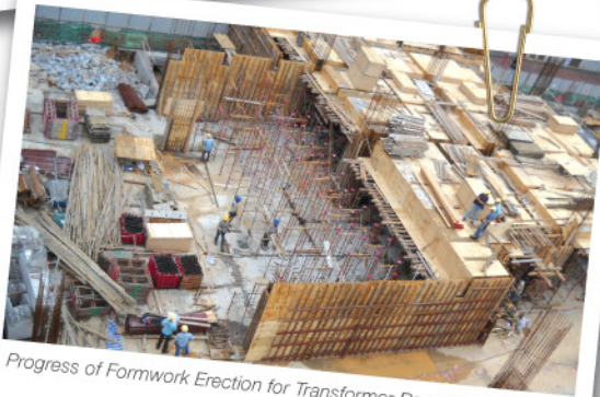
Progress of Formwork Erection for Transformer Room up to 2/F