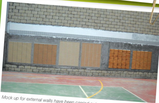
Mock up for external walls have been carried out