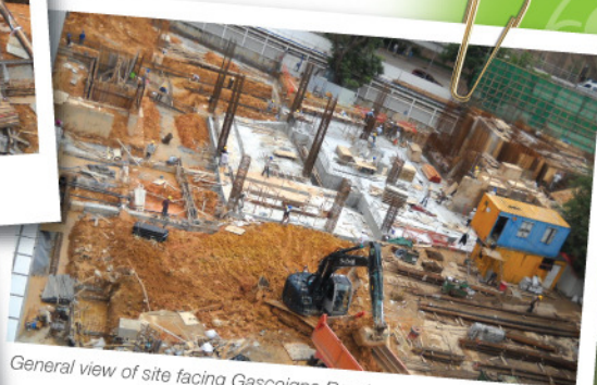
General view of site facing Gascoigne Road