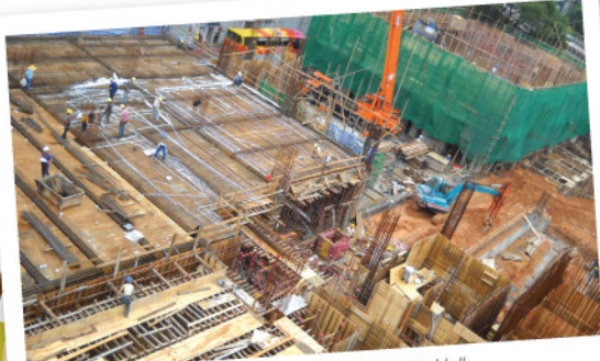
Progress of formwork erection for DGJS Sports Hall