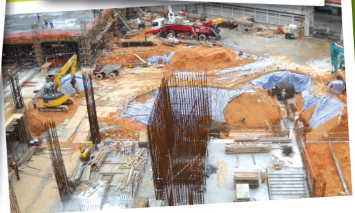
Lift Core 3 & 4 under construction