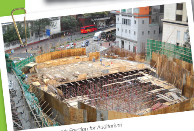
Progress of Formwork Erection for Auditorium