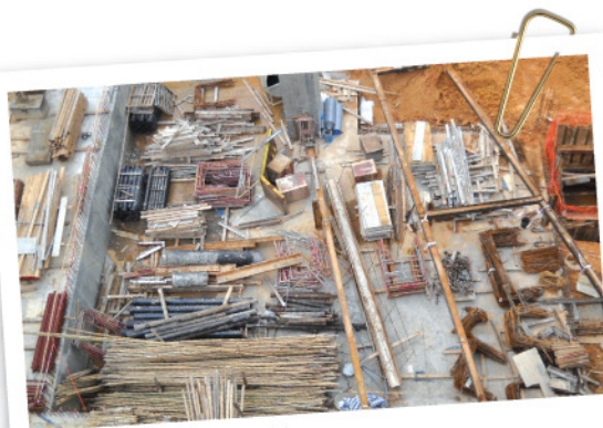
Overall works was on schedule