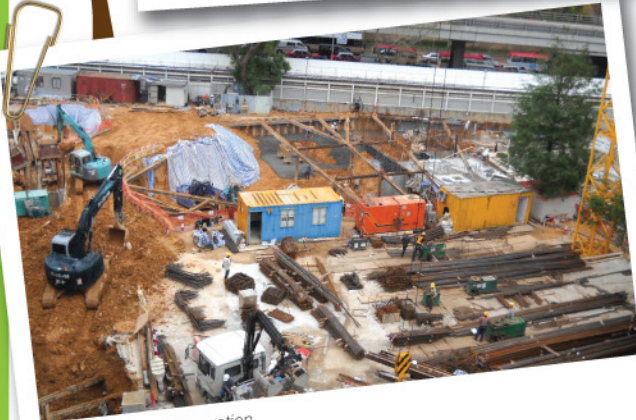
Swimming Pool Excavation