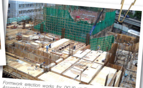
Formwork erection works for DGJS staff room at L3 and DGJS Assembly Hall at L2 were in progress