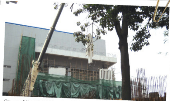
Some of the external walls of SIP block have been demolished