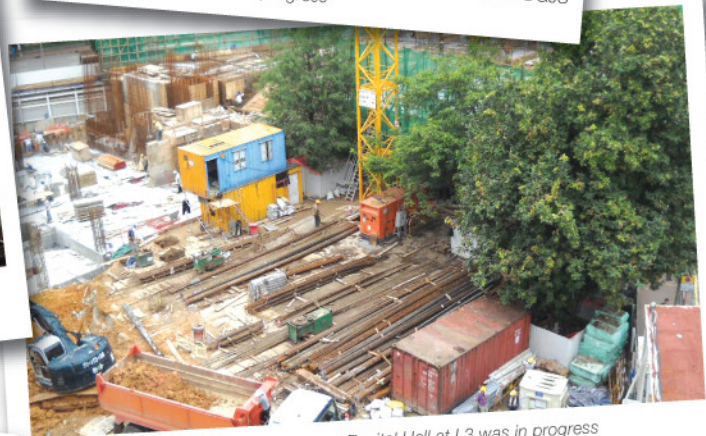
Reinforcement fixing works for 300-seat Recital Hall at L3 was in progress