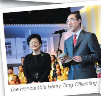
The Honourable Henry Tang Officiating