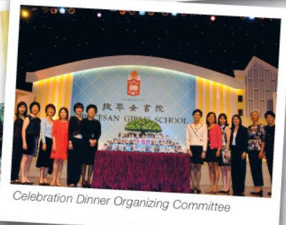
Celebration Dinner Organizing Committee