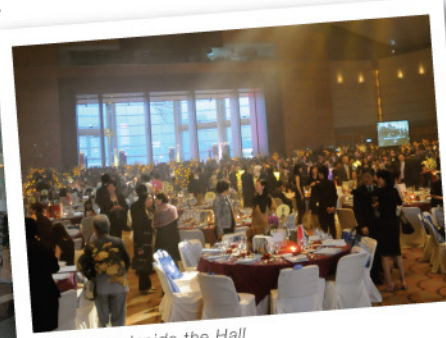
A Glimpse Inside the Hall