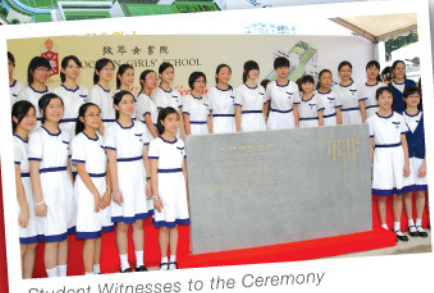
Student Witnesses to the Ceremony