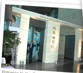
Entrance to the Grand Hall