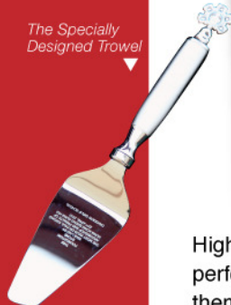
The Specially Designed Trowel