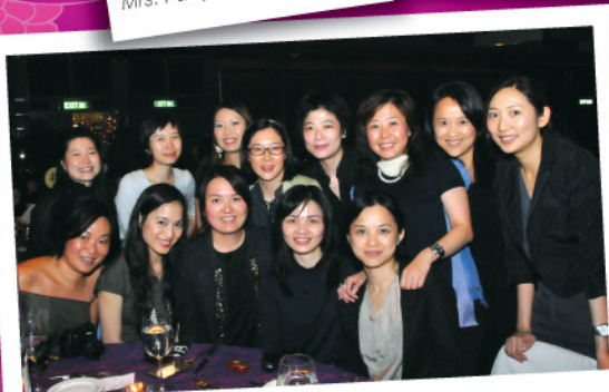
Class of 1992