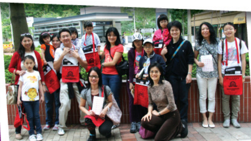
Hong Kong Adventure Corps Flag Day volunteers