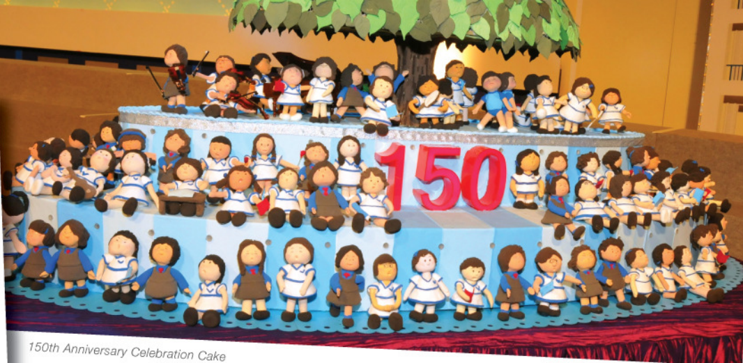
150th Anniversary Celebration Cake