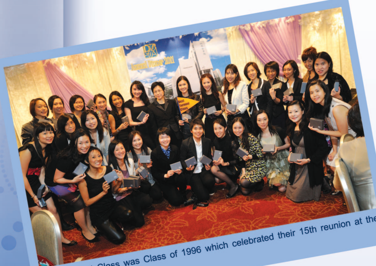
Best Turnout Class was Class of 1996 which celebrated their 15th reunion at the dinner