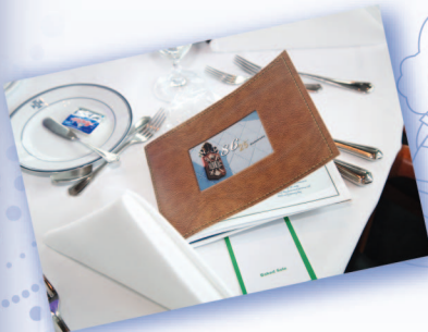
Thanks to all who contributed photos to the photobook