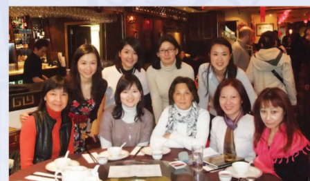
One family, unbroken: Old girls gathered to celebrate Chinese New Year over scrumptious dim-sum

Wonderful news for old girls on British shores! The DOGA UK chapter is in full swing since its revamp in 2010. Over the past year, old girls partook in a tour in picturesque Oxford, an asset management masterclass, a fun-filled theatre trip, a warm CNY celebration, an open-house gathering with live music, as well as hearty dim-sum lunches around London. Standing at 150 members, ranging from students to retirees, we unite and support old girls in the spirit and tradition of DGS. Preparation is under way to usher in another successful year with the launch of a careers / mentoring programme via face-to-face and online seminars. (Those interested in becoming mentors – do get in touch!) Whether you are in the UK for education, employment or looking to expand your business and personal network, please email us at dgsalum.uk@gmail.com and visit http://diocesan-alumni.org/DGS_Alumni_UK/ for details.