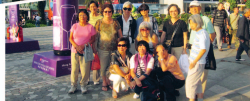
Ngong Ping 360 Cable Car trip and a visit to the Peak