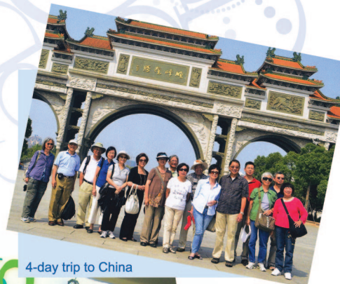
4-day trip to China

In order to make our Golden Anniversary a very special and memorable one, we organised a 7-day itinerary for our class. Our classmates returned from all over the world, including US, Canada and Australia, to participate in this very special event. The activities included two days of sightseeing in Hong Kong, a celebratory dinner, a 4-day trip to China (Nansha, Panyu and Shunde) as well as a tour of our new DGS campus.