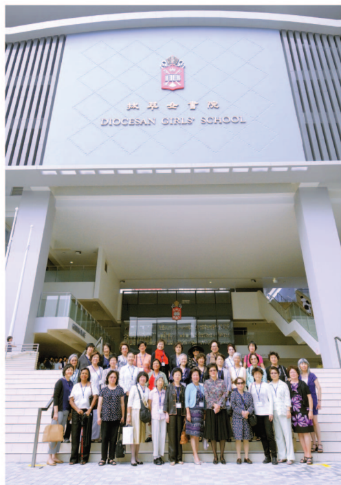
Standing under the School Crest at the new DGS campus