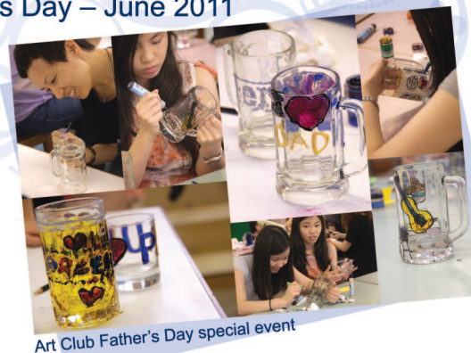
Art Club Father's Day special event

Further to the success of the Mother's Day special activity in May, the Art Club hosted a stained glass painting session to prepare lovely personalised stained glass beer mugs for Father's Day. Our members and their children had an afternoon of fun. All worked hard together to outline drawings and paint beer mugs, snack bowls for their beloved dads.