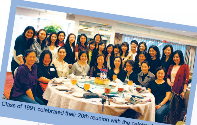
Class of 1991 celebrated their 20th reunion with the celebration cake