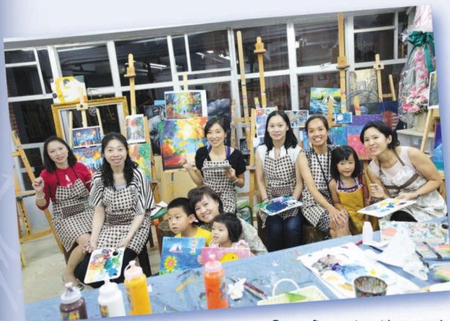
Cozy after-party art jam session