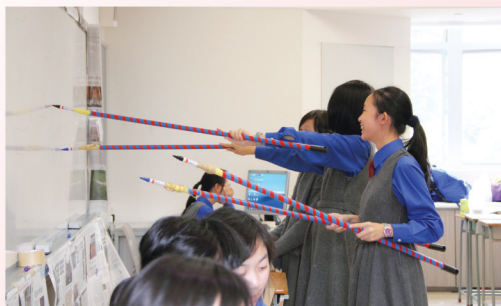
Girls having fun at a games stall