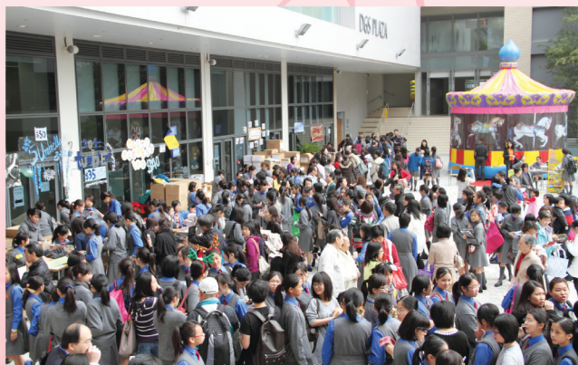
The carousel-themed bouncy castle - a crowd-pleaser and a huge success

The Mini Bazaar 2011 was organized by the Mini Bazaar Committee, and included members of the Prefects' Board forming the cohort who are pursuing the New Senior Secondary curriculum leading to the HKDSE. By all accounts, it was hugely successful, with money raised for the eye clinic and other charitable projects. It was certainly one of the most memorable mini bazaars ever.