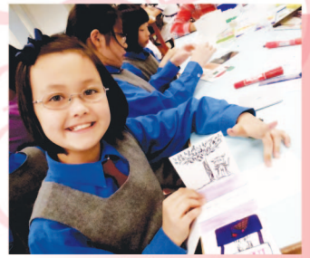
Look at what I've made!

The School aims to provide an all-round educational experience for its students, ranging from workshops and contests to outreach opportunities and international exposure, allowing them to grow into caring, thoughtful and multi-dimensional individuals. This year, apart from allowing students to excel and contribute through service projects, overseas exchange programmes, MUN conferences and symposiums, the School launched an exciting joint-school science and art leadership workshop with its counterpart, Singapore Chinese Girls' School (SCGS), for the very first time.