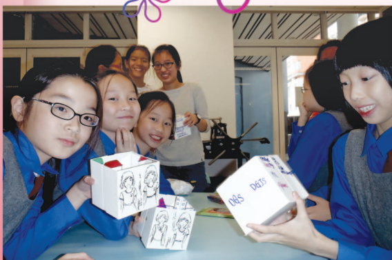
Beaming DGJS students showcase their creations

This exchange program not only helped develop DGS students' leadership skills through mentoring their little sisters, it also strengthened the bond between SCGS and DGS. It gave the Diocesan family the opportunity to gain greater international exposure through working with Singaporean students.