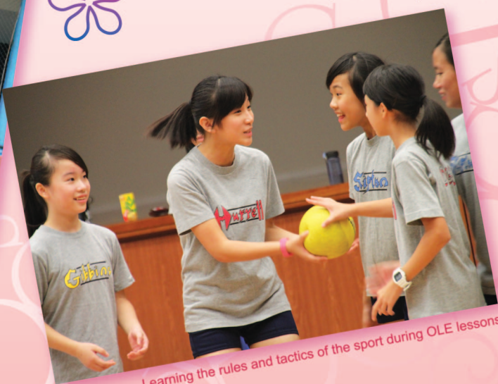
Learning the rules and tactics of the sport during OLE lessons