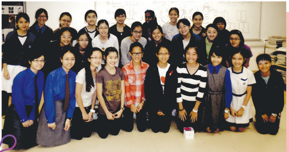
The SCGS & DGS Joint-School Service Project Team