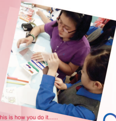
This is how you do it..... SCGS student guiding a DGJS student in playbox design