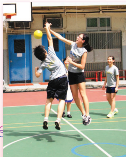
Intercepted at the very last moment!

Students are eagerly anticipating the inter-house and inter-class dodgeball competitions that will be held later in the school year.