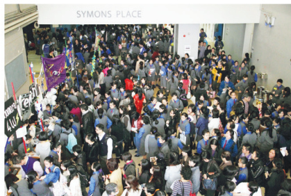
Sales stalls in Gibbins Place, Symons Place and the DGS Plaza drew huge crowds of people

After months of intense preparations, the first ever Mini Bazaar at the newly redeveloped DGS campus came into being on 21st December, 2011, with over 6000 guests including parents, Junior School girls and old girls in attendance. They joined in the fun-filled delights of shopping for exclusive DGS-branded items and engaging in games, whilst taking the opportunity to marvel at the buildings of the new campus. This year was also special in that a large part of the Mini bazaar proceeds was donated to an eye clinic set up by a DGS old girl in the Democratic Republic of Congo.