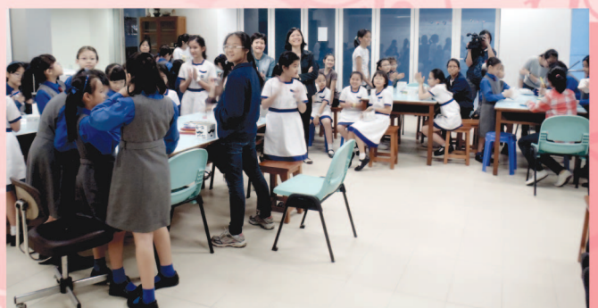
DGS....DGJS...SCGS.....One big happy family!

Thanks must be given to the organizers and teachers from DGS, DGJS and SCGS for making this joint-school service project possible. The students from both schools shared and contributed themselves fully; their hearts shone from within as they lived out the school motto of "Daily Giving Service".