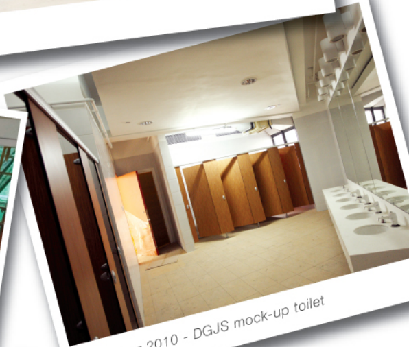
November 2010 - DGJS mock-up toilet