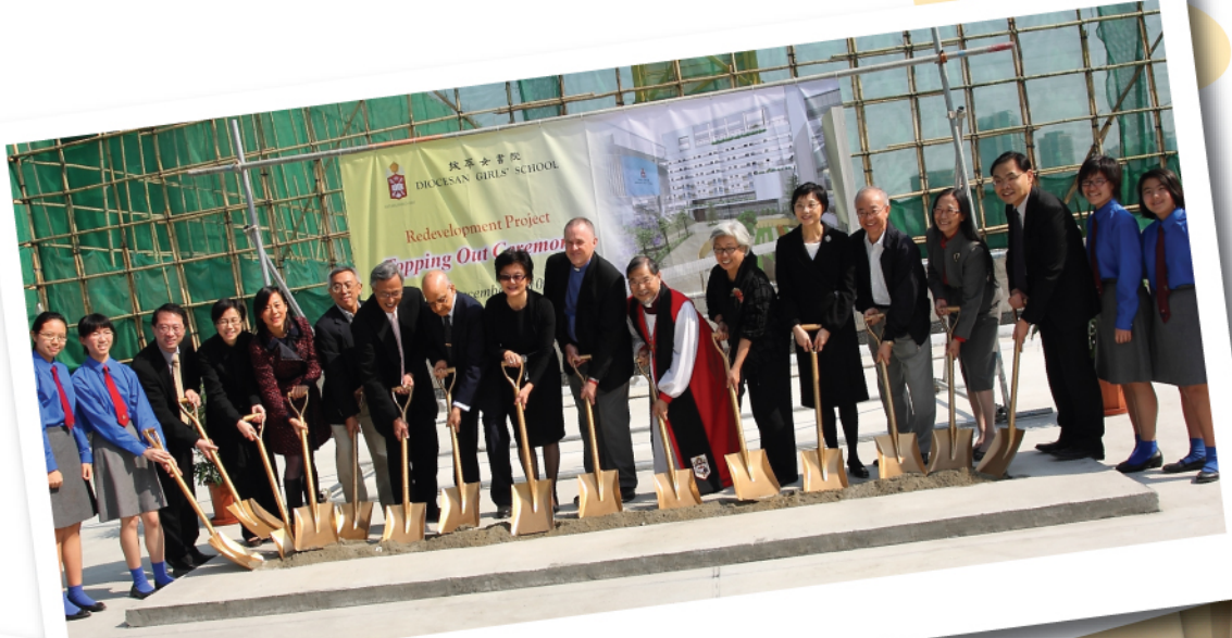
December 2010 - Topping Out Ceremony