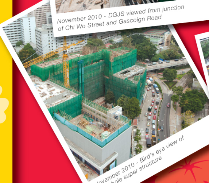
November 2010 - Bird's eye view of the whole super structure