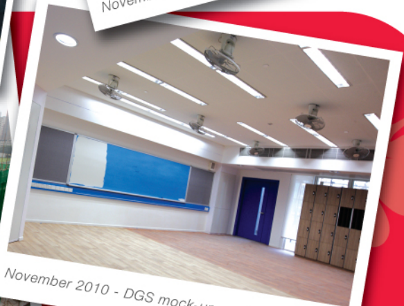
November 2010 - DGS mock-up classroom