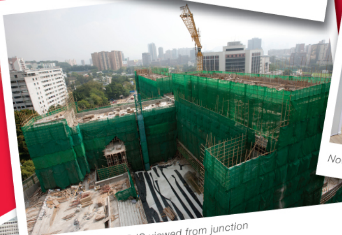
November 2010 - DGJS viewed from junction of Chi Wo Street and Gascoign Road