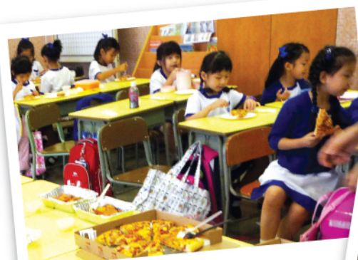
P1A enjoying the Pizza Party

The class with the highest amount: P.1A $77,690.00