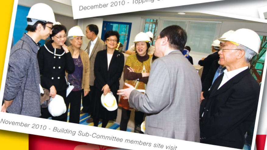
November 2010 - Building Sub-Committee members site visit