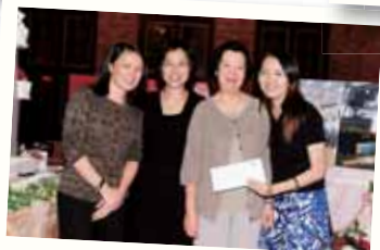
First prize winner from the lucky draw