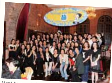
Best turnout class - Class of 1992 with 48 old girls