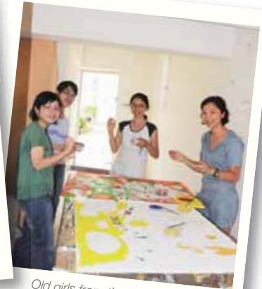
Old girls from the Art Club enjoying a fun afternoon