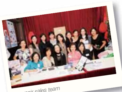
Souvenir sales team