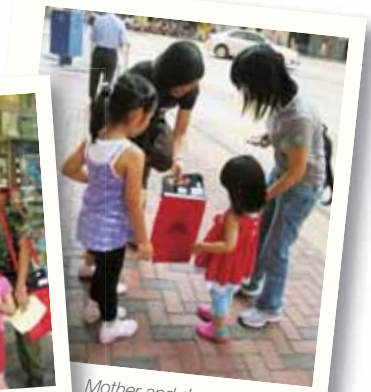
Mother and daughter selling flag to the pedestrian

The Hong Kong Adventure Corps Flag Day and the Heep Hong Flag Day took place on September 26 and November 21 respectively. These events attracted both alumnae and their young children as an introduction to community service.