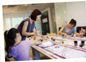
Mothers and children working diligently on the design

In November and December, the Art Club invited both old girls and their children for two afternoons of fun with stained glass. The children made their own little stained glass stickers, while the mothers created stained glass paintings for the DGJS Hotel School.