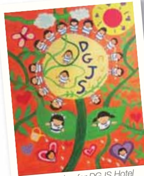
Mural painting for DGJS Hotel School

In July, a few keen art enthusiasts gathered in a cozy afternoon to paint a mural for DGJS Hotel School. Our old girls splashed their love and fun under the mid-summer sun, and enjoyed a BBQ and pizza party after completing the task.