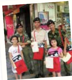
The Adventure Corps Flag Day was highlighted by the sight of uniformed cadets from the Hong Kong Adventure Corps