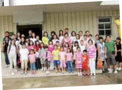
Participants of the visit