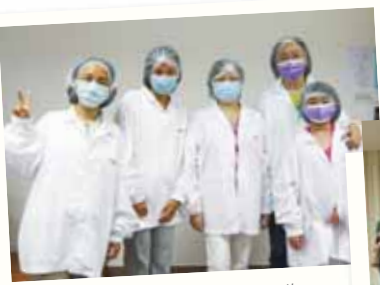
Visitors wearing masks and protective coats before entering Calbee's production facilities