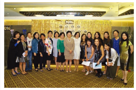
Annual Dinner Organising Committee

Our DOGA Annual Dinner has no doubt become an important annual event that brings us together for a great celebration of our school and its traditions. On 28th October 2016 550 old girls from the Class of 1957 to the Class of 2012 attended the gala dinner themed "Dazzling Glam Slam". Ten classes came together to celebrate their respective milestone years and the Class of 1991 won the Best Turnout Class, with 48 girls attending. With sparkling wine in hand, old girls went around the foyer looking for friends to greet, souvenirs to buy and fancy hats to wear for a memorable photo. In the Best Dressed Competition, a total of 15 gifts were given to the 5 houses, with 3 Glam winners from each house. There were 3,000 lucky draw prizes, table prizes and individual gifts – the most we've had in prizes ever! Everyone brought home a bag of goodies, and most importantly, some very fond memories of this reunion night!