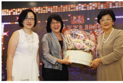
Lucky draw 1st prize winner