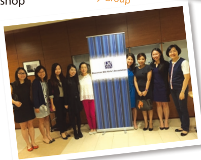
Finance Interest Group