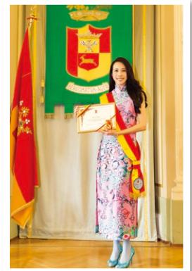
Karen Morris (Class of 1987)

We would also like to congratulate Karen Mok (also known as Karen Morris, Class of 1987) for receiving the "Cultural Ambassador" award from the Bergamo Government, Italy, in May 2016. It is the first time that such an award was conferred upon an Asian global artist by the Bergamo Government, whilst previous awardees listed are such as Luciano Pavarotti and Elton John.