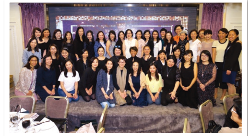
Best Turnout Class – Class of 1991