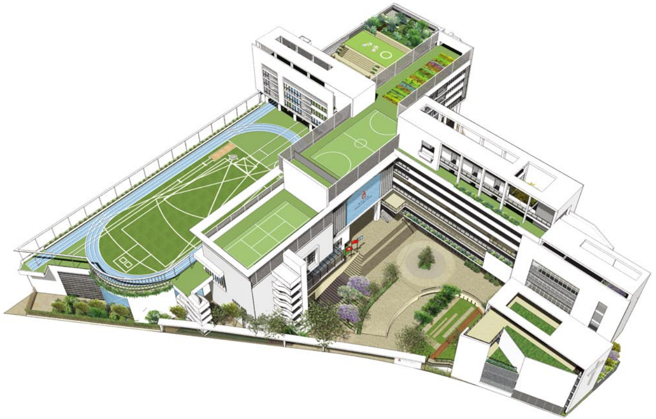
An Aerial Impression of the New Campus