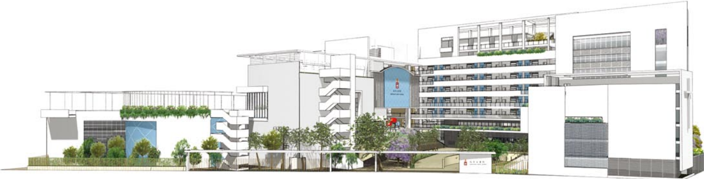
Impression from across Jordan Road