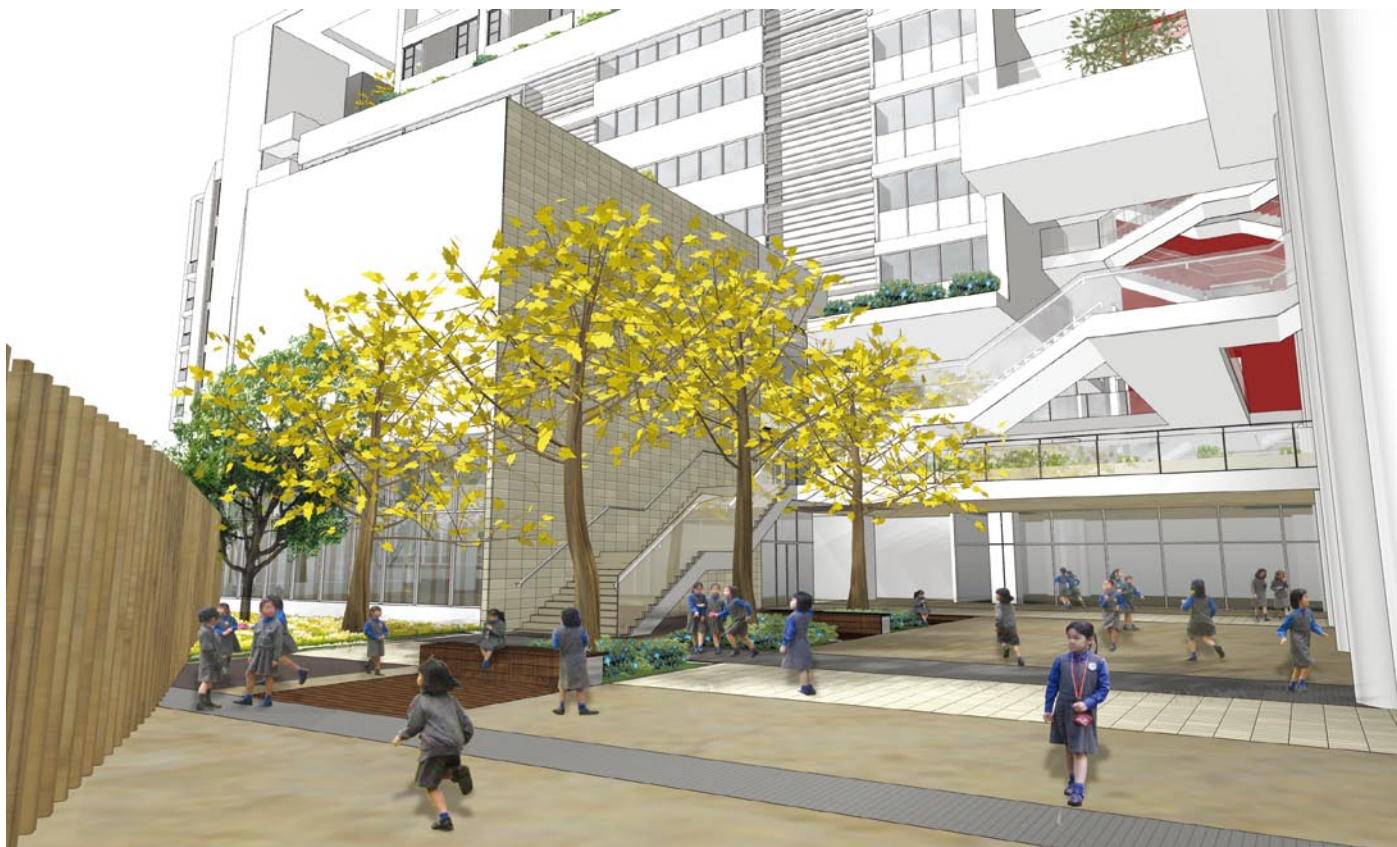
Projected Glimpse of a Corner of DGJS

Joyful learner of life who strives for excellence Discerns need for change, and changes with courage Gives daily with joy and humility to enrich the lives of others