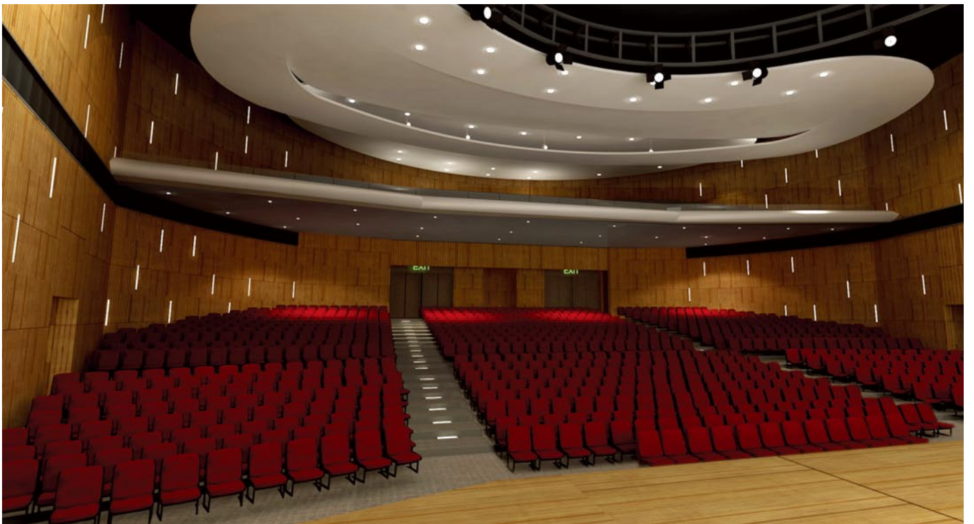
A Glimpse Inside the Auditorium

Note: All designs are subject to finalization by the architects.